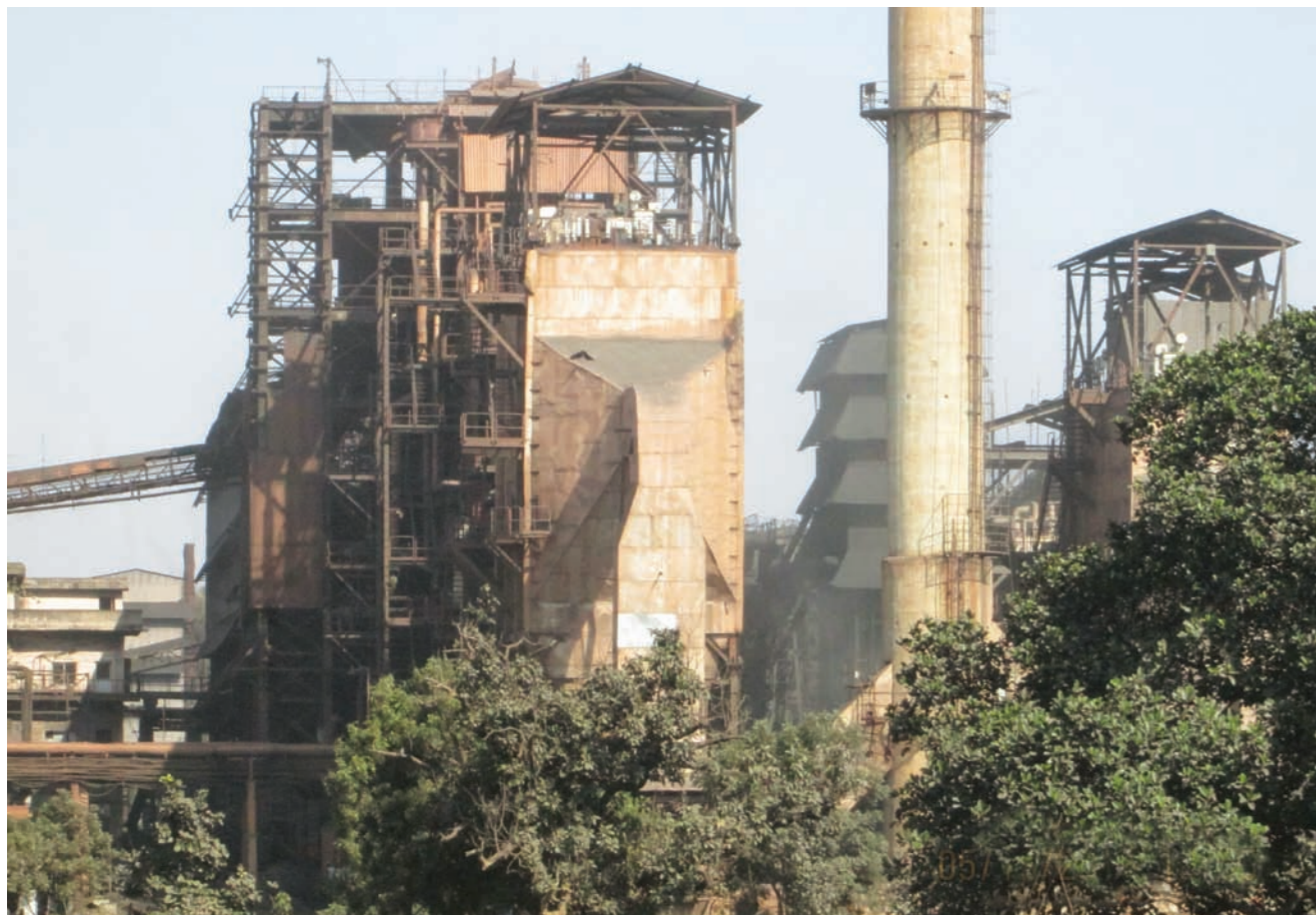
Pattanaik Steel and Alloys Ltd in Purunapani village of Jhumpura Block, Odisha.

What also came to light was that most of the Plants and mines in Joda and Jhumpura block of Keonjhar District do not comply with the mandatory environmental conditions like sprinkling of water to control dust on the roads, dumping yard, and the mine overburdens. While black-topped or concrete roads and water sprinkling are not enough, it can certainly reduce the amount of dust reaching people's homes and farmlands. The same applies to covering the trucks carrying iron ore or manganese with tarpaulin. These requirements are clearly laid in the Consent Orders issued by the State Pollution Control Board and Environment Clearance granted by the environment ministry.