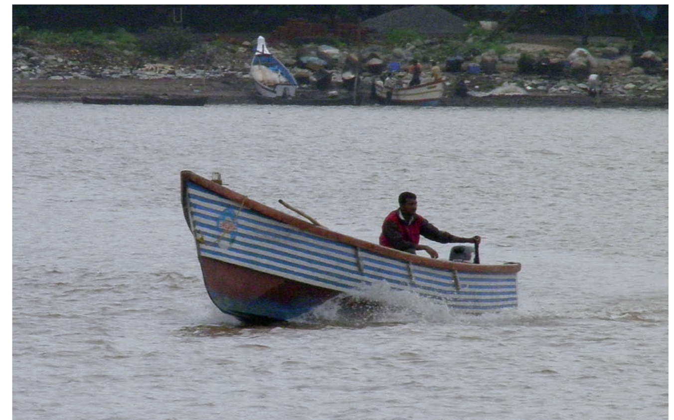
The coast of Uttara Kannada district, Karnataka.

The 'Coastal Regulation Zone Notification, 2011 (earlier 1991) has been issued by the central Ministry of Environment, Forests and Climate Change (MoEFCC). It lays out regulatory procedures for activities to be carried out in different parts of the coast. The main objective of the 2011 notification is to protect the livelihoods of traditional fisher folk communities, preserve coastal ecology and promote economic activity necessary for coastal regions.