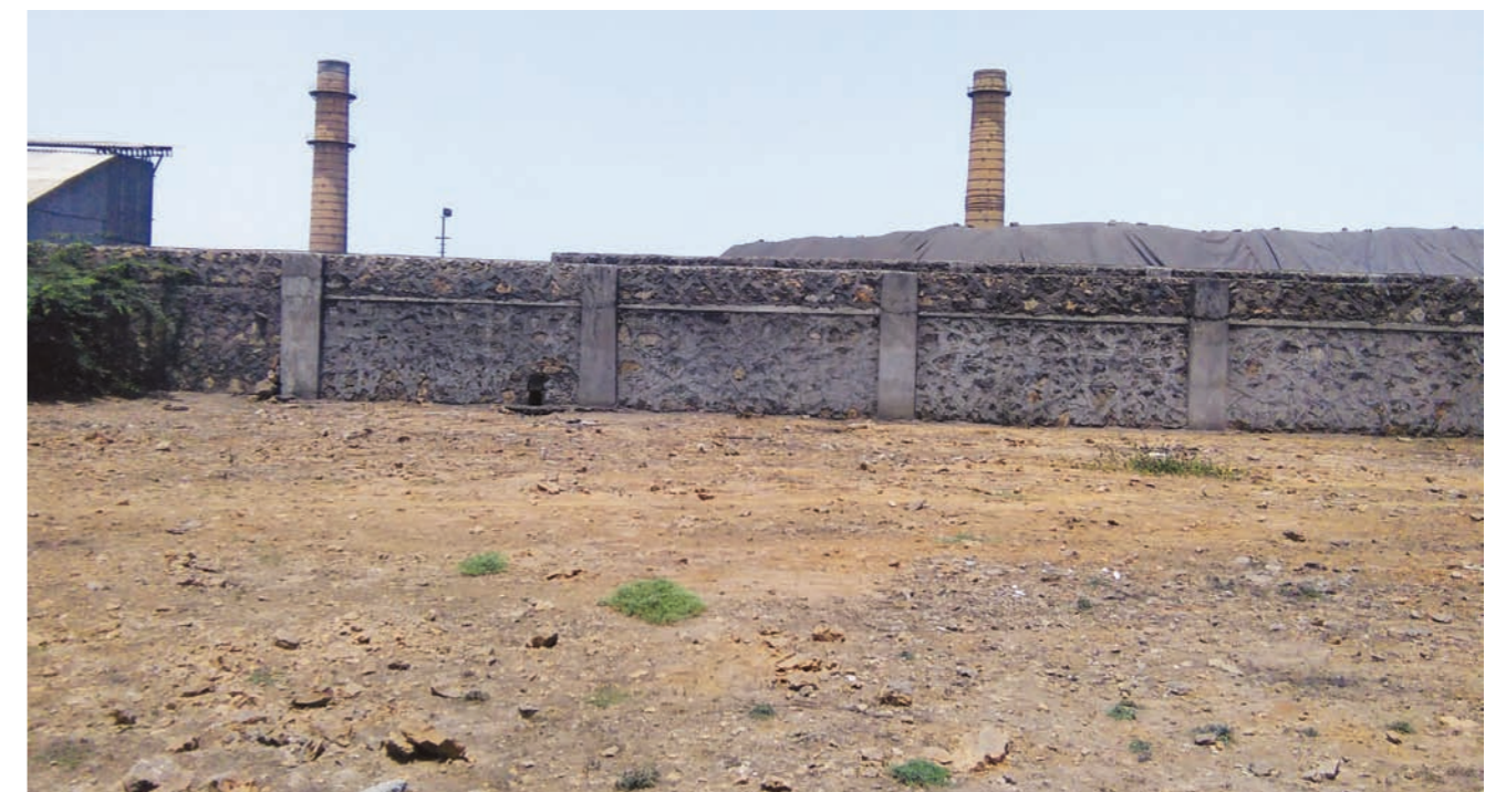
BLA Coke Company, with its wall below 9 mts height.

The dust from the coke oven plant has other impacts too. When the air blows from the west to east direction it impacts the mangroves and the fishing areas.