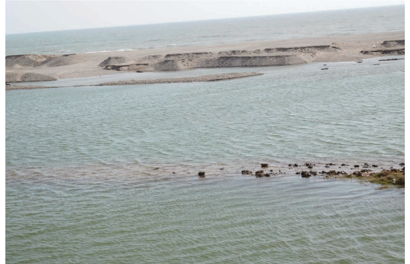
The River bed now.