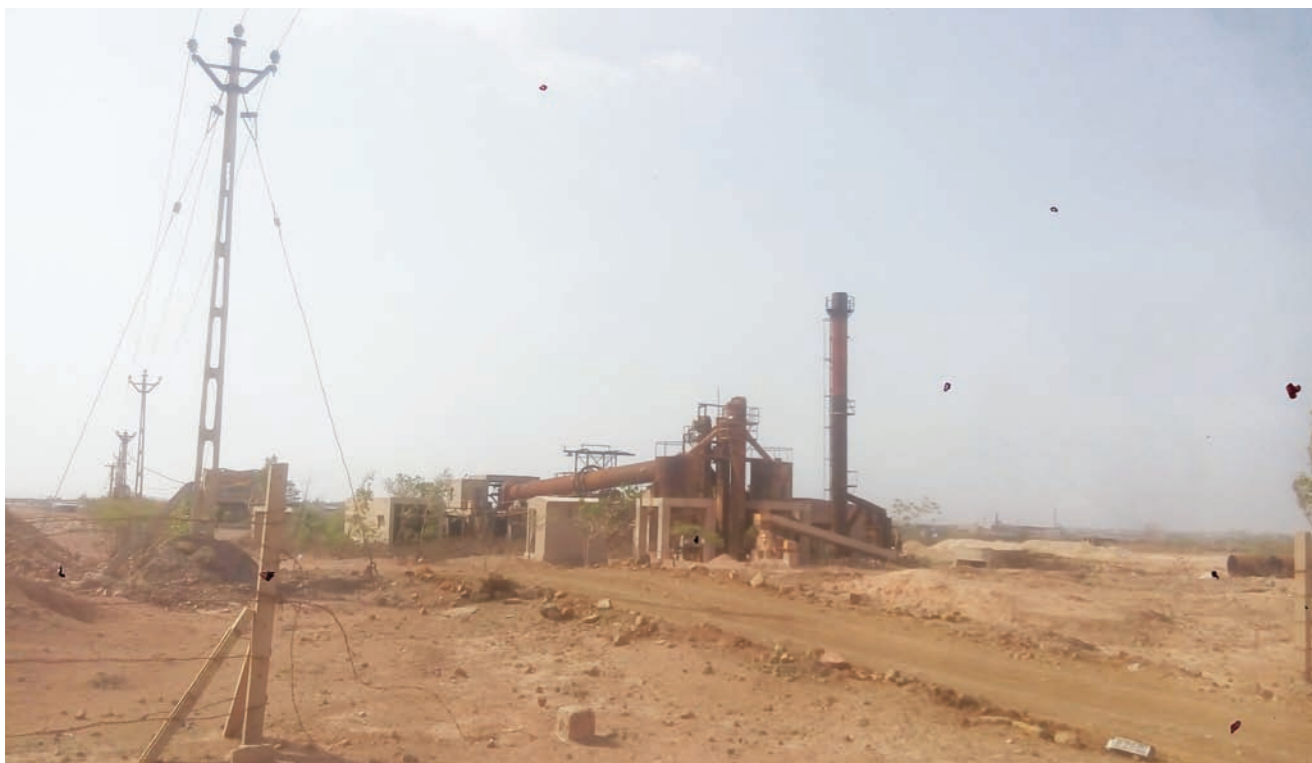
The Somnath Bauxite Plant

This extensive use of Bauxite without applying any safeguards has caused mineral dust to spread in the nearby areas, especially on the farmlands. This has directly affected the ploughable land of the farmers. We saw a large, unprotected mound of Bauxite in an open plot area. There was also no sprinkling of water on it (sprinkling of water makes the bauxite dust floating in the air settle down).