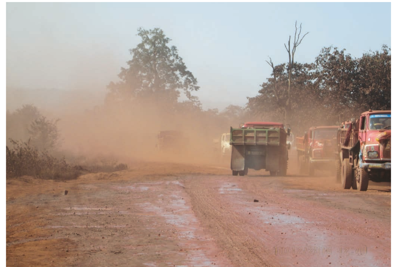
Dust generated in transportation of minerals to Railway siding at Nayagarh, Odisha.

From this situation, one could imagine the fate of the villagers who are residing in these areas.