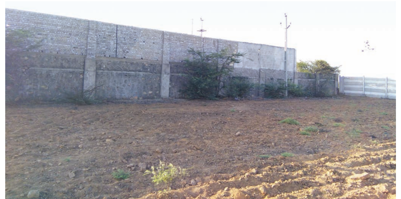
Wall surrounding the back of the company raised to 9 m after the complaint.