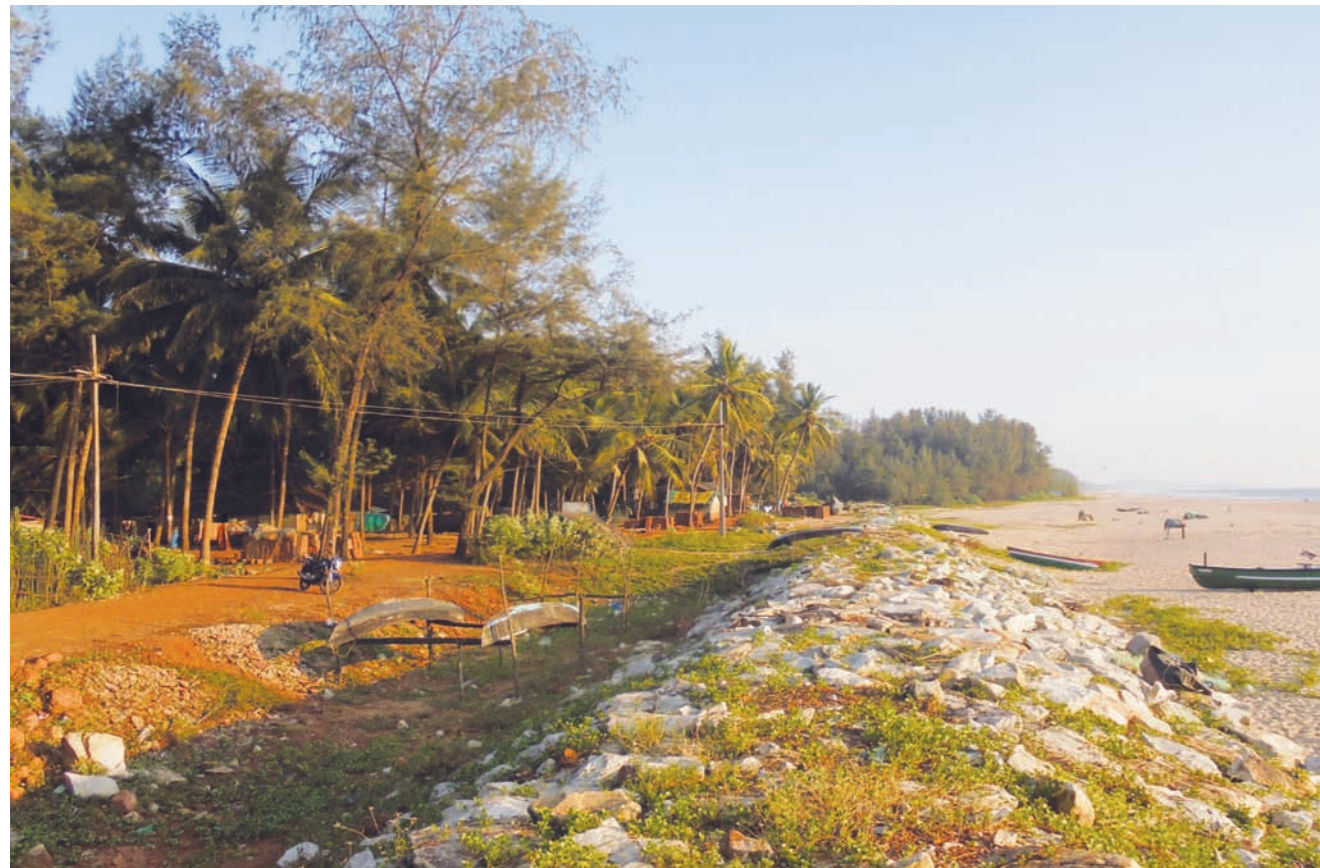
The coastal village of Kagal, Kumta, Uttara Kannada.

A farmer from Kagal, Kumta tells me "Please find some buyers for me, I have two acres of land near the beach. I hear that under the CRZ law, all our lands will be acquired and we will be homeless then. So I