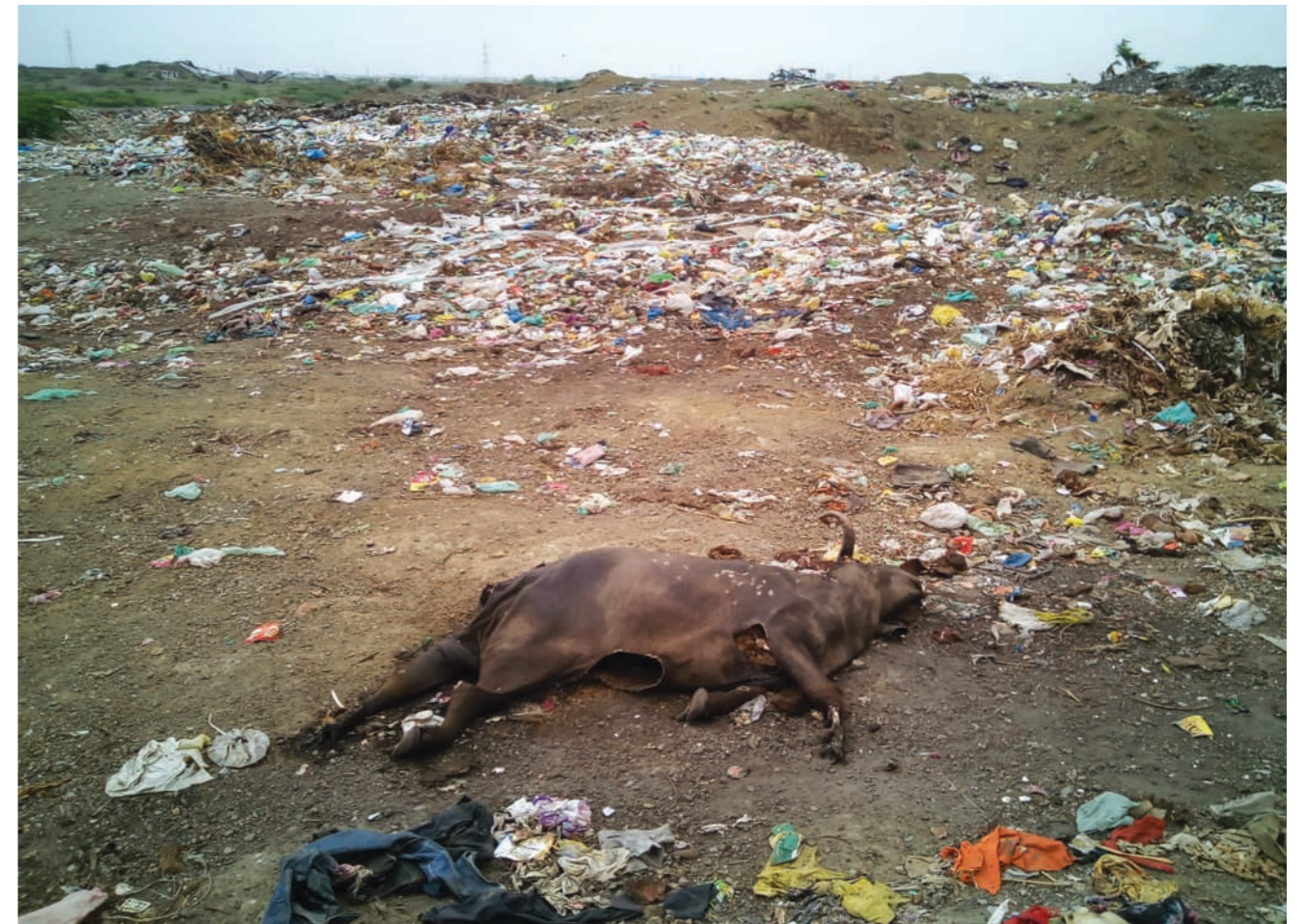
Dumping all types of waste including dead animal carcasses.

At one point, frustrated with no response, the women had walked over to the site and attempted to stop the operator from dumping waste on the site. The site operator simply filed a police complaint against the group of women. This was a push back at one level, but they were not willing to give up so easily.