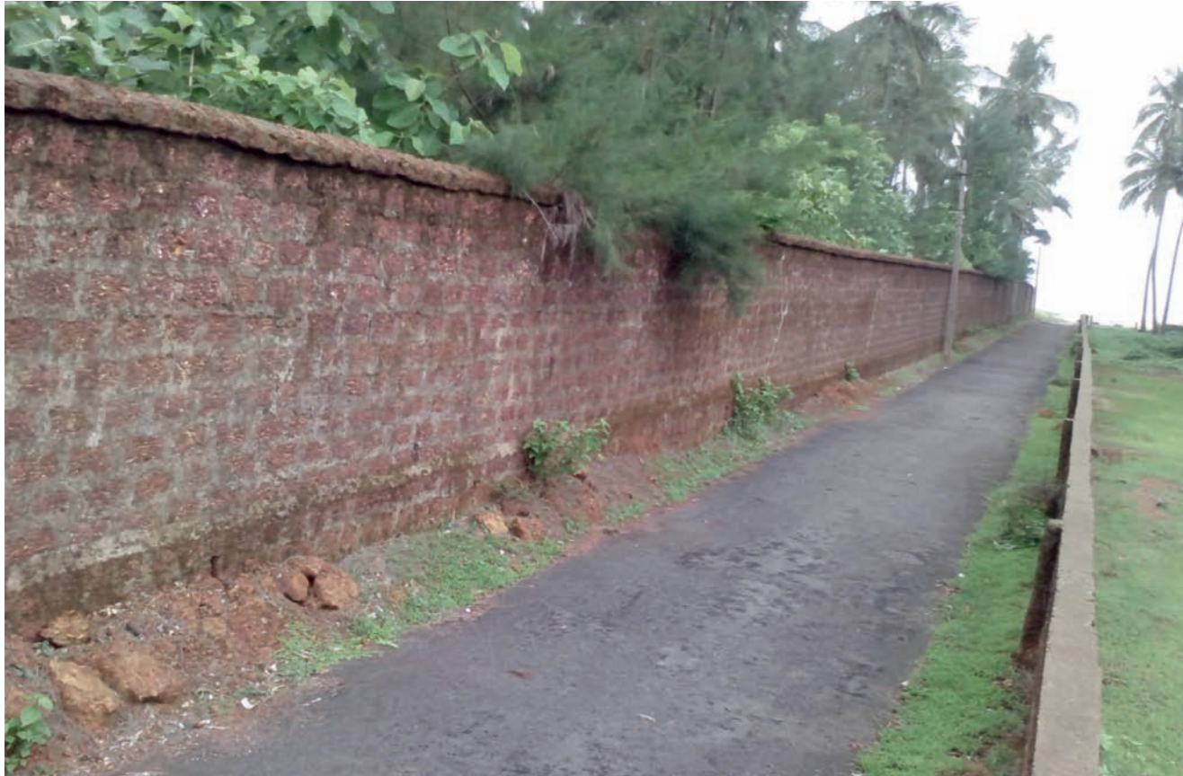
Nayak Hospitalities compound area