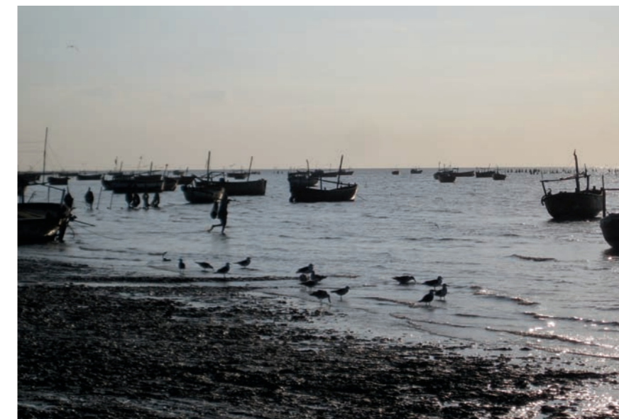
Fishing boats parked in the inter-tidal area at Bavdi Bander.

It came to light by accident. On January 22, 2013, a committee constituted by the Ministry of Environment and Forest was visiting the area. Set up on September 14, 2012 to review the violations of the Adani Port and the Special Economic Zone located 45 kilometres away from the Bavdi bander, its members also decided to visit the bander to investigate claims about compensatory mangrove plantations in the area. Representatives of the Gujarat Coastal Zone Management Authority (GCZMA), local fish traders, and representatives of the Machimar Adhikar Sangharsh Samiti (a fishing union of the area) also accompanied the committee members.