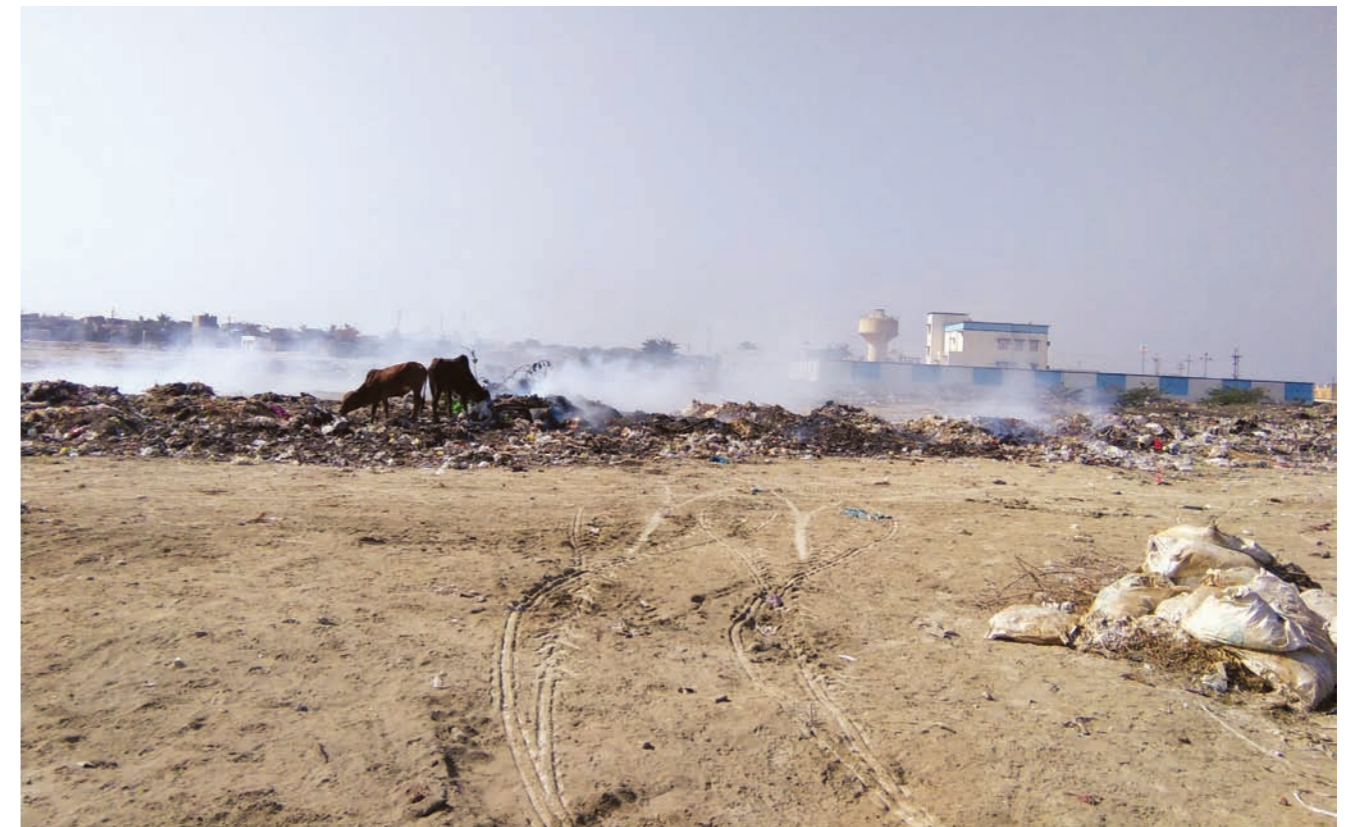
Burning of the municipal waste near Bakshipunch Housing Society.

Residents of Arambhada village, including from Bakshipunch had complained of several health problems like, malaria, typhoid and dengue. They couldn't prove it was due to the dumping of waste and the contamination thereafter, but strongly felt that this was an important contributing factor.