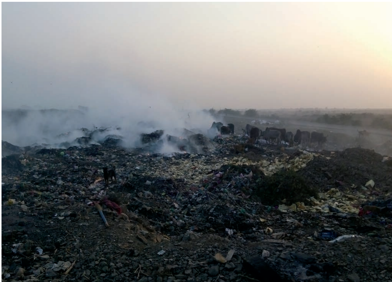
Burning the waste of Gandhidham at Meghpar.

Whether a legally tenable remedy was possible in Meghpar needed to be assessed. When we began gathering more information and did background checks on the issue, the first question that came to mind was this: How is this site complying with the laws related to municipal solid waste, especially the provisions of the Municipal Solid Waste (MSW) Rules, 2000?