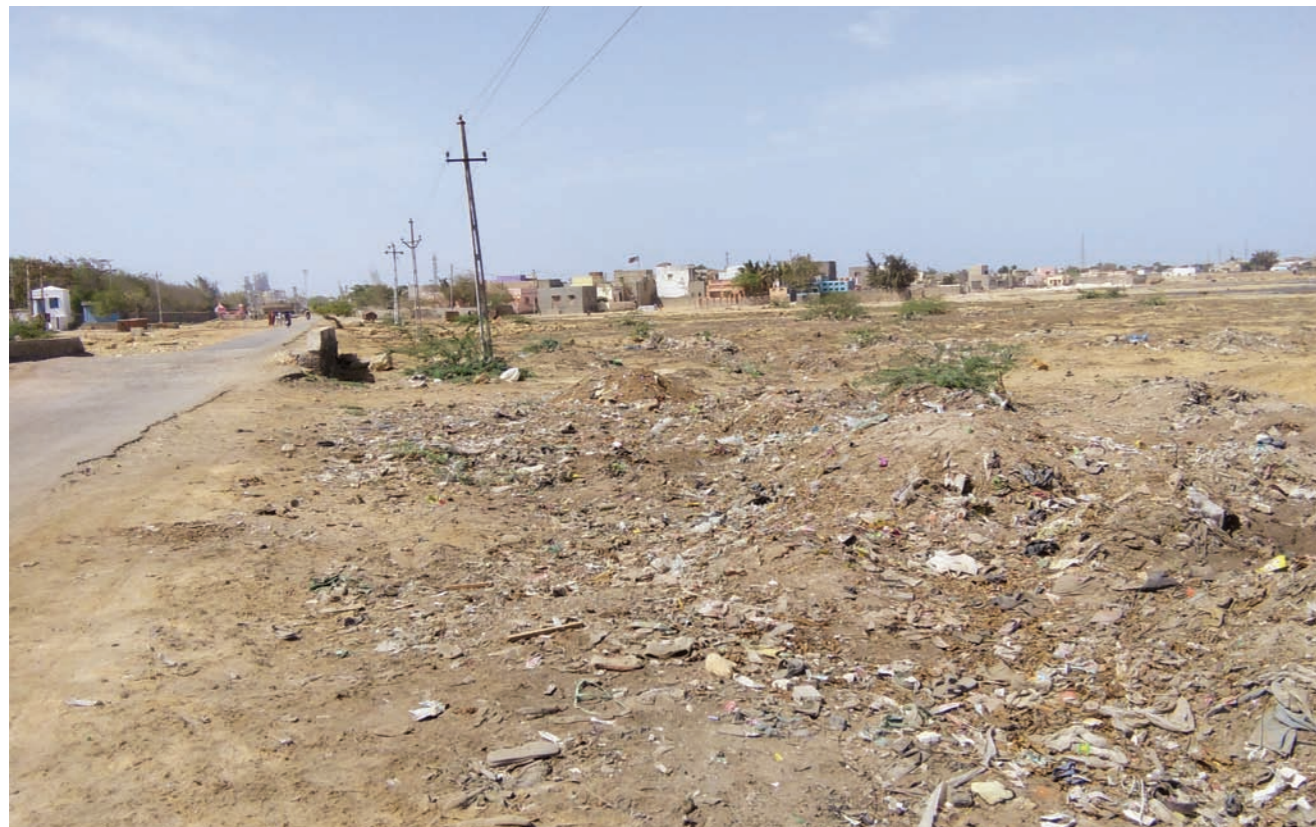
Waste lying around near Bakshipunch Housing Society.

In 2016, the Municipal Solid Waste guidelines of 2000 were replaced by the Solid Waste Management Rules. While the earlier guidelines were applicable to municipal authorities, the 2016 rules were applicable to all the waste generators.