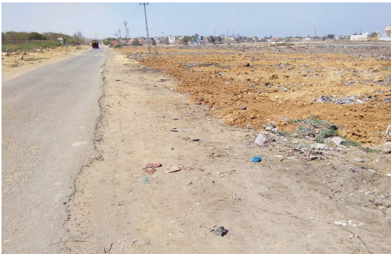
The dumping site was cleaned and cleared after the residents of Bakshipunch Housing Society pursued the municipal officer to fix the issue.