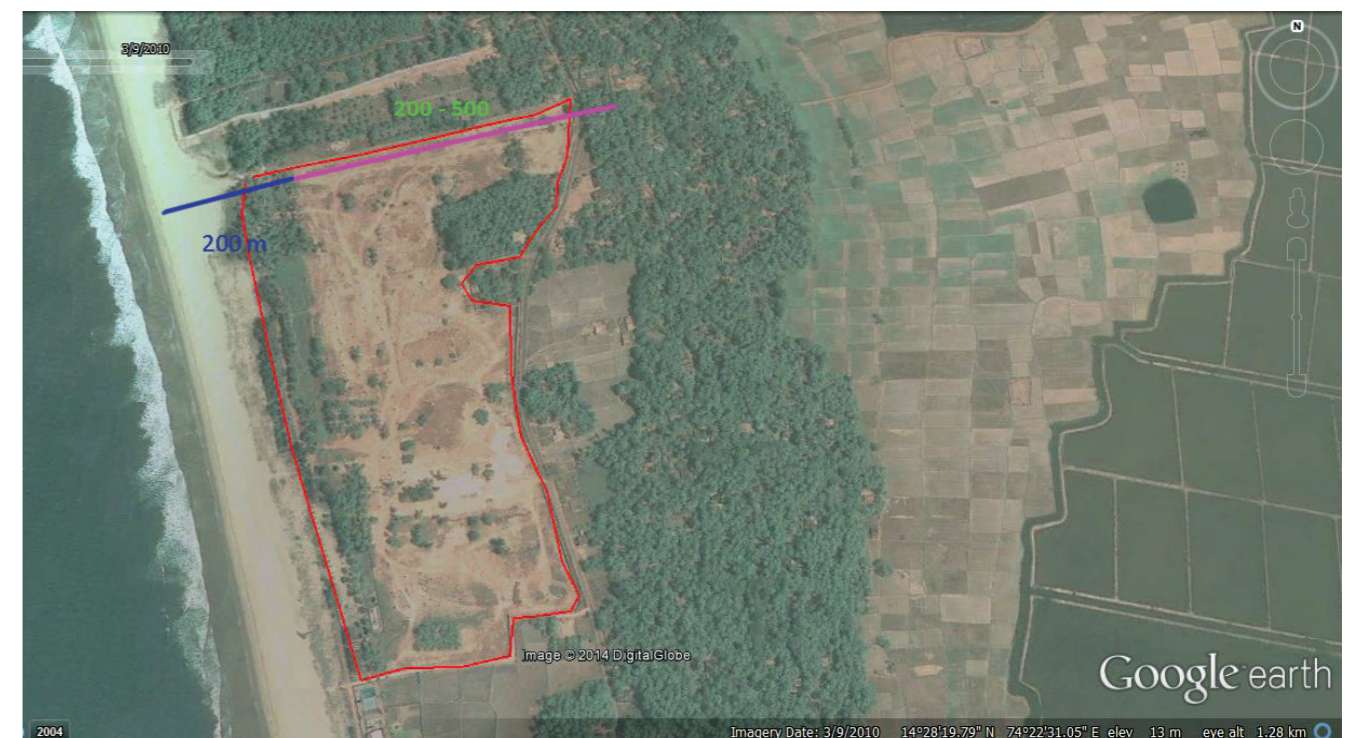
Satellite image of the Nayak Hospitalities compound

As an Enviro-Legal Coordinator with the Centre for Policy Research (CPR)-Namati Environmental Justice Program, my job is to inform people about the law, and work with them to solve the various environment-related problems they face. I had helped conduct training programmes on awareness of the Coastal Regulation Zone Notification, 2011 (“CRZ Notification”) in Baad and surrounding areas. This led to discussions about the violations caused by NH and a decision to work together in collecting information, evidence, and pursuing remedies with the local authorities. Collection of information is central to the way we try to resolve problems. That way, if a similar problem arose in the district, a solution based on this case could be used.