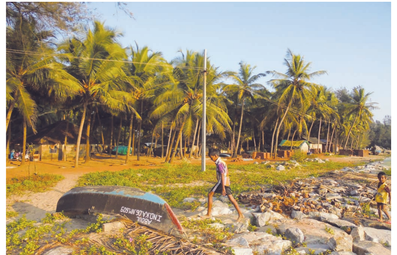
The fisherfolk community in Kagal, Uttara Kannada.

In the 11 Panchayats of Kagal, Baad, Holanagadde, Kalbhag, Devgiri, Divgi, Mirjan, Kodkani, Bargi, Gokarna and Alkod that we visited, it was revealed that more than 58 applications for housing schemes had lapsed because