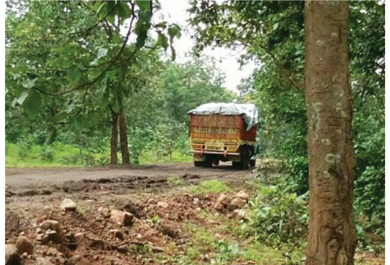
Purunapani road is repaired, mineral transportation with covered back and water sprinkling is happening.

After the complaint, PCB's regional officials visited the site on 23rd March 2017. Interestingly while they upheld the violations related to dust, they were not as vehement about the waste discharge in the river. In the inspection report PCB clearly mentioned that, “Approach cum transportation road is of kacha type road which is in a very bad condition”. Dust emission was observed during movement of vehicles on the road.