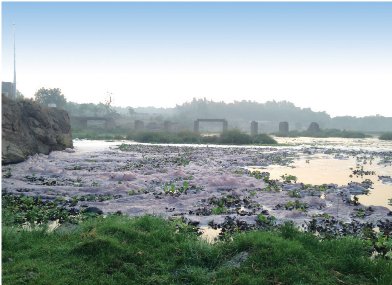
The polluted river Daman Ganga in Vapi.

Vapi is perhaps one of the few municipalities in the country which has two rivers flowing through its limits carrying the industrial effluents. While, the river Kolak flows on the northern end, river Daman Ganga borders the southern end of this industrial town before it meets the sea. There is a large population, estimated to be over 5000, which is dependent on both these rivers and its estuaries for fishing. ( Reference STATISTICAL DIARY year 2012-13 ).