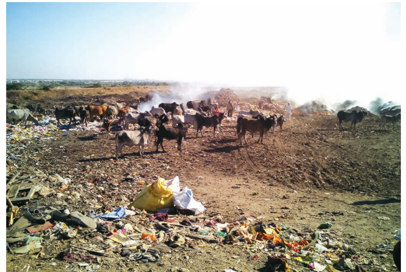
Cattle roaming in the dump site.

This game included pictorial representations of the relevant clause of MSW rules. Each picture was numbered. The women had to then correlate the specific clause related to the issue at hand, onto a blank display sheet, and in the process learn the law. It was time now to visit the GPCB regional office.