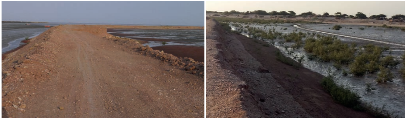
A view of the bund built on the inter-tidal area.

In need of a remedy, some fisherfolk from the area approached the High Court of Gujarat. It took several hearings and over 18 months for a final judgment to emerge from the Court only on August 27, 2015. The District Collector had told the Court on April 10 that the lease for the salt pan had not been renewed. If any bunding activity did happen therefore, the District Collector could take action.