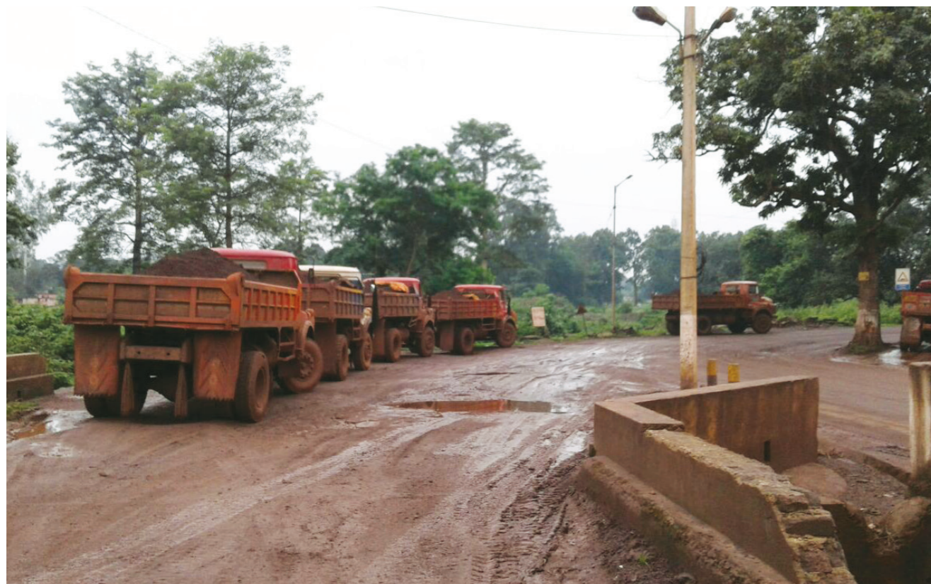
Minerals being transported without the covering of tarpaulin.

In their letter to the Keonjhar regional and state office of the Pollution Control Board (PCB), the women highlighted that Pattanaik Steel and Alloys Ltd was violating Air Prevention and Control of Pollution Act (1981) through emission of smoke and generating dust in transportation of minerals without covering the truck load with tarpaulin. Due to massive scale of transportation on the village road, the condition of the road was very bad which led to more dust and impacted the agriculture fields on both sides of the road.