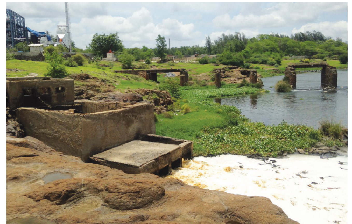
CETP effluent discharge point at river Daman Ganga, Vapi.

Other than the above legal requirements, the Vapi action plan of the GPCB states that the treated effluent from the CETP must be discharged in the deep sea through a pipeline, and not in Daman Ganga river, as has been