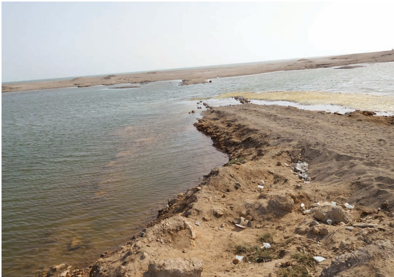
The path built for illegal sand mining at the Triveni Sangam.

An equally bigger question for me was whether this was just my nostalgia or was this extraction of sand creating problems for people living nearby?