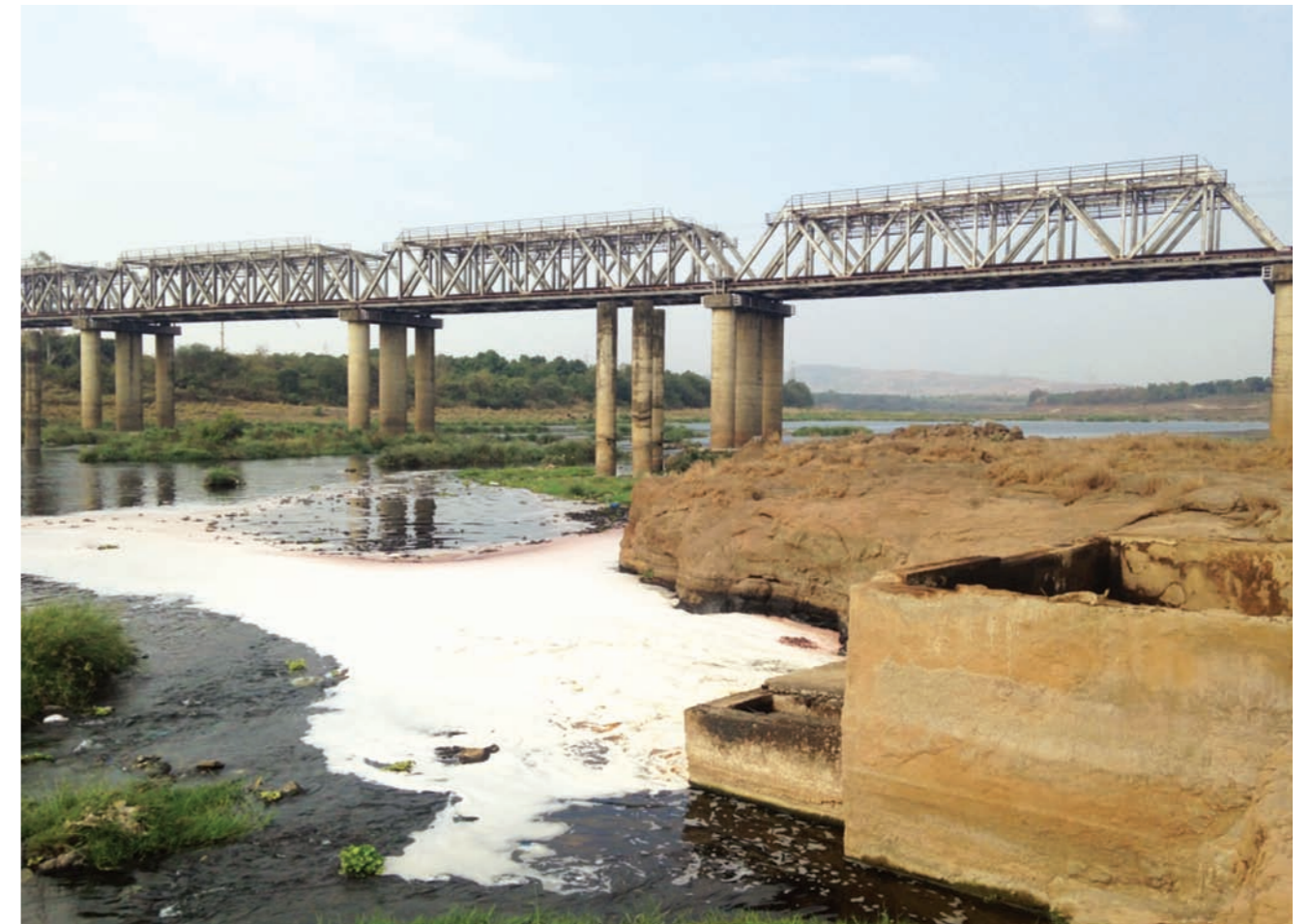
Indiscriminate dumping of hazardous waste has polluted the river Daman Ganga in Vapi.

In 1995, there was a case filed in Supreme Court by Research Foundation, a NGO, against the Union of India(writ petition(civil) No. 657 of 1995) over water contamination issues in Gujarat and Madhya Pradesh, which is still pending. The SC set up a monitoring committee following the petition and asked it to file a report before the court.