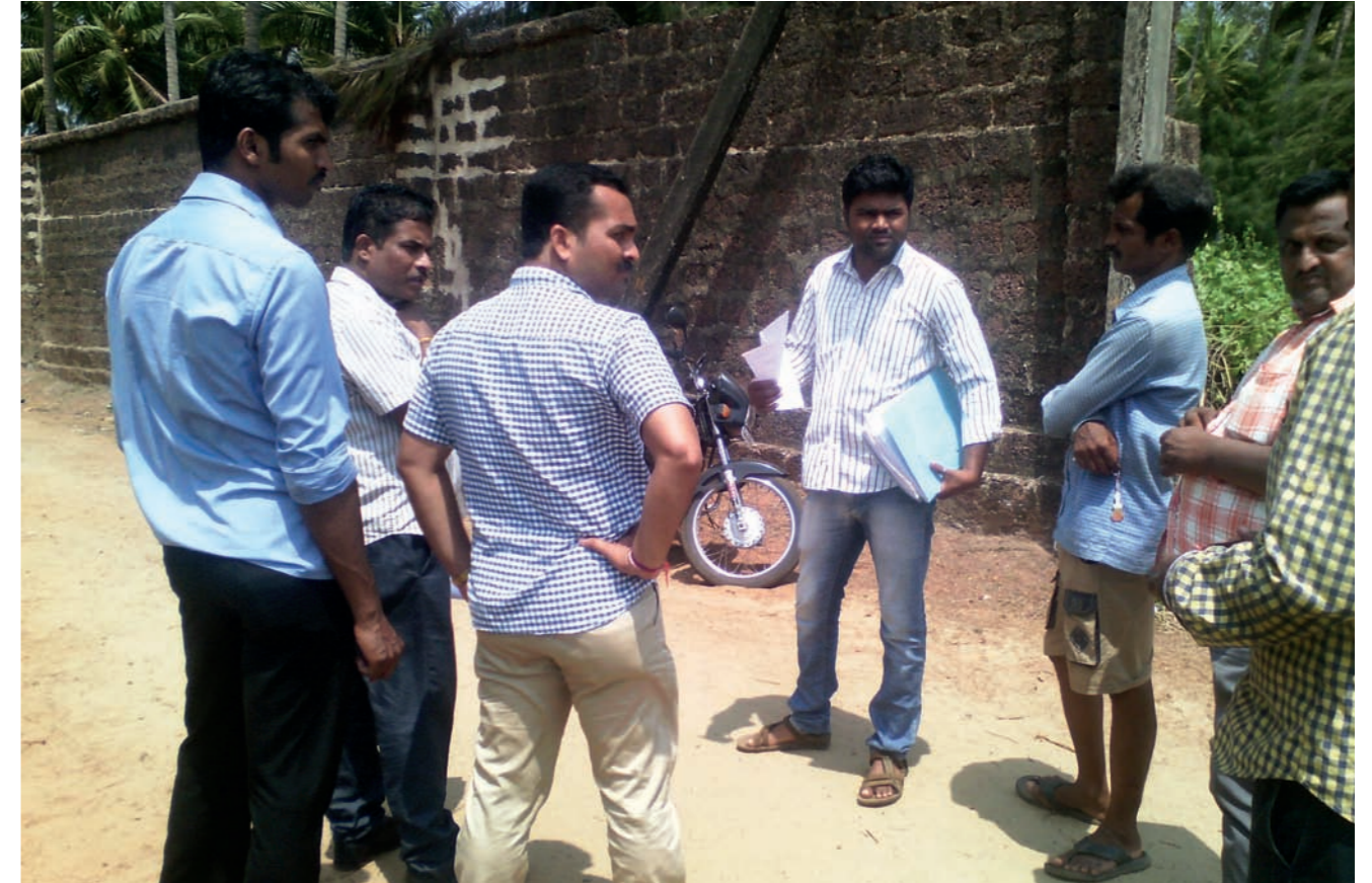
Site Inspection by Regional Director

Since no relief followed, the villagers and I decided to send letters to all relevant authorities including the District Commissioner (" DC "), Executive Officer (" EO "), and the Panchayat Development Officer (" PDO "). Site inspections were carried out and once again, notices were issued against NH. Upon request by the villagers,