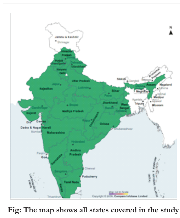
Fig: The map shows all states covered in the study

Table 1 shows provisional results for the number of healthcare providers available to an average person in 1,520 villages, with an average population of 3,498, chosen