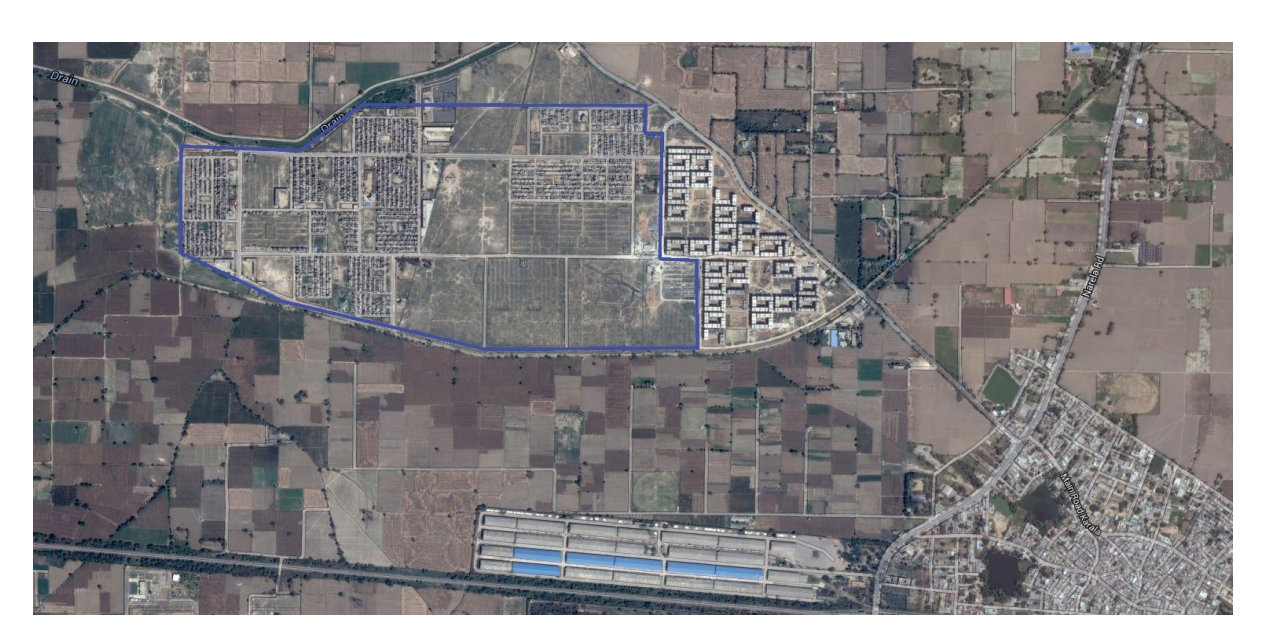
Savda Ghevra ]] Resettlement Colony is outlined in blue. The surrounding farmland is visible, as is the low density of development, compared to the rest of Delhi. An interactive map of this and other research sites is available at citiesofdelhi.cprindia.org/map.

The colony was built on agricultural land that had been