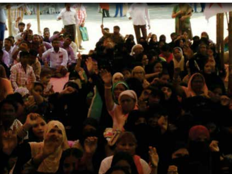
Dharna by ASBS at Azad Maidan, Feb 2017

The data and our experience of working in Mumbai suggests that schools have extraordinary discretion in the admission process, which limits the success of RTE 12(1) (c). While access to schools has improved considerably with introduction of the online admissions process, the procedural difficulties have not been addressed adequately. Lack of political will and effort is a serious impediment in bringing a change in this scenario. We need collective effort from people, along with systematic government initiatives, for successful implementation of the RTE.