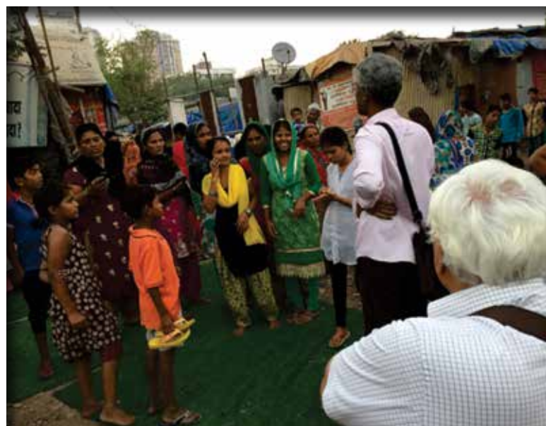
Community interaction by ASBS members