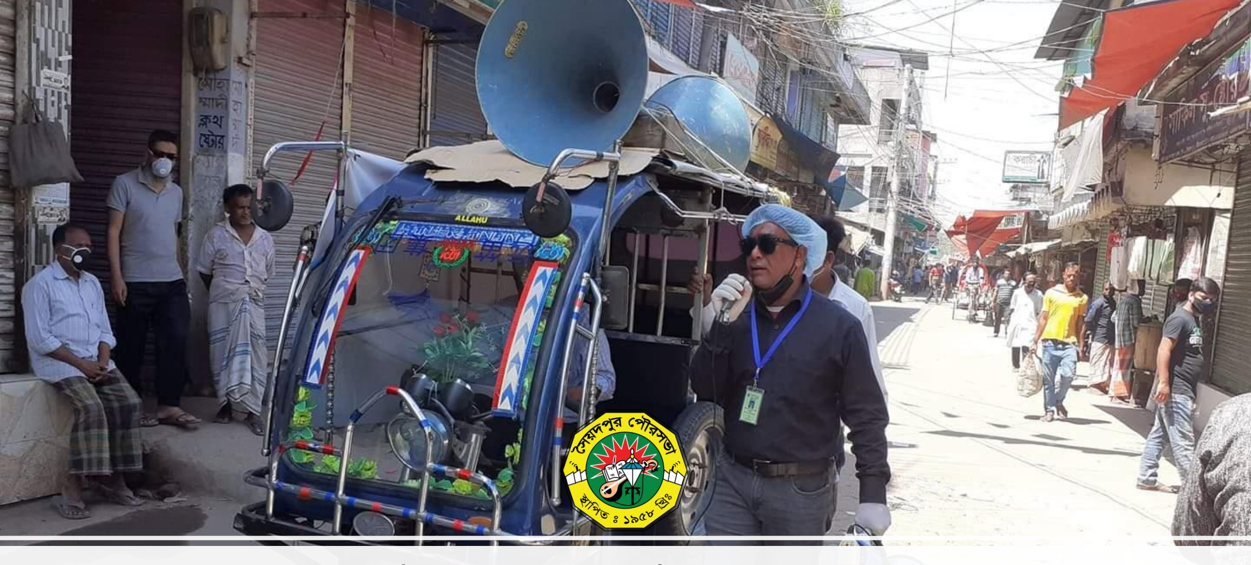
Initiatives From Saidpur Municipality on WASH During COVID-19