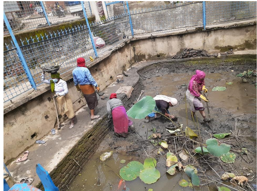
Traditional Water sources Cleaning