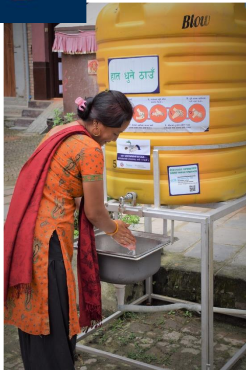
Contact less hand washing station at community level in all wards