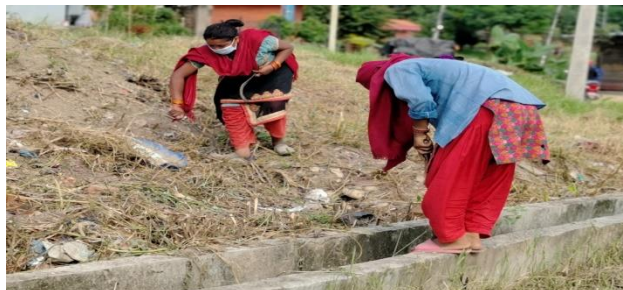
Environment cleaning for prevention from COVID 19